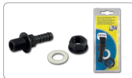
Raccordo blisterato Blistered joint