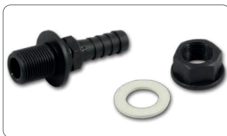
Raccordo con ghiera e guarnizione Only Joint with ring nut and gasket