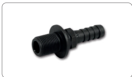
Solo raccordo Only joint